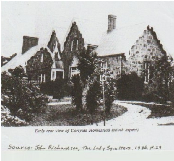
Fig. 3 Coriyule Homestead, Drysdale

Construction of their 'stone cottage' began in 1849. It was designed by architect