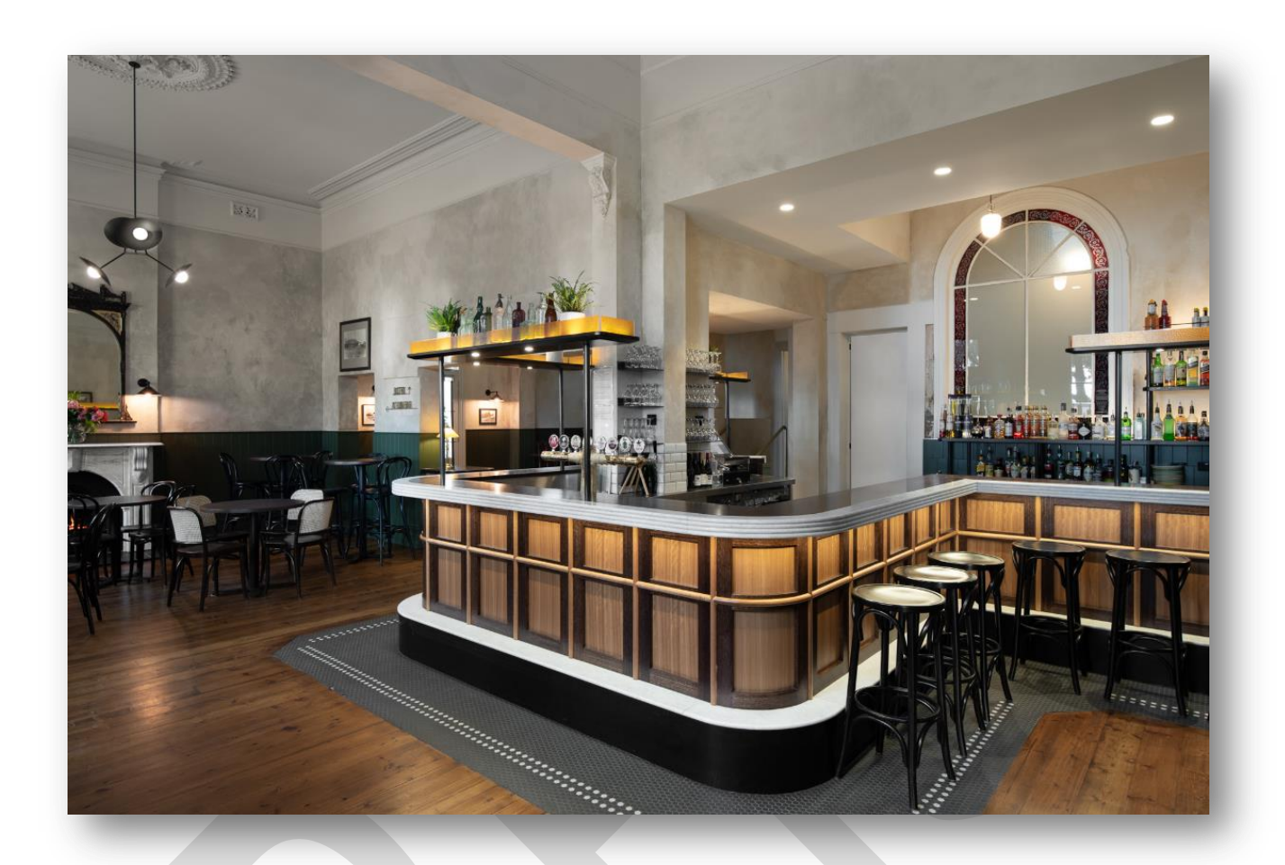
CHANGING TIMES 2023